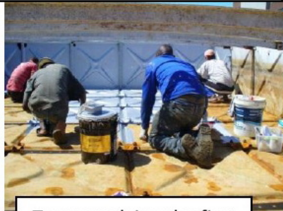
Team applying the first coat of Rustbullet with rollers