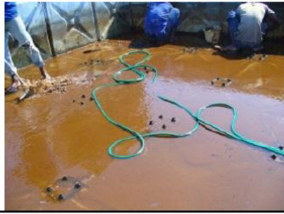
Condition of tank with no water