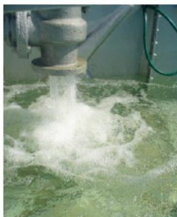
Water pouring into first tank