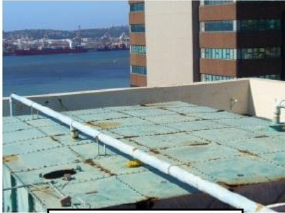
Top of water tank

We were only able to do the Tanks over the shut down period being Xmas. Total area of work is 1446 sqm. We removed the lids and used high pressure cleaning with Bi- Carb to neutralize the PH. We allowed to dry after which we used 300 microns of Rust Bullet. The Total Job was completed in 6 days. The tanks are now back in operation with the total Building been on line with fresh water.