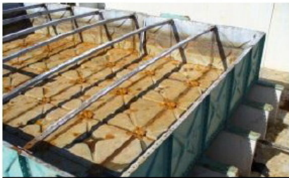
Tank showing ibeams across for roofing