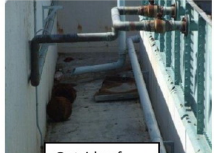
Outside of tank