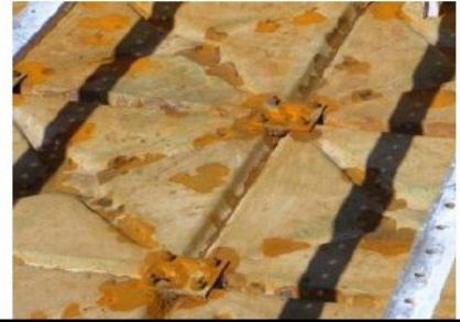
Tank after high pressure cleaning