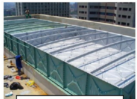
Team busy on outside of second tank