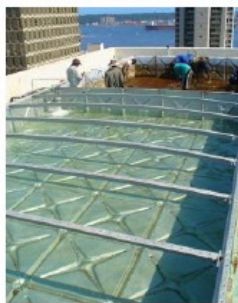
Team busy with second tank